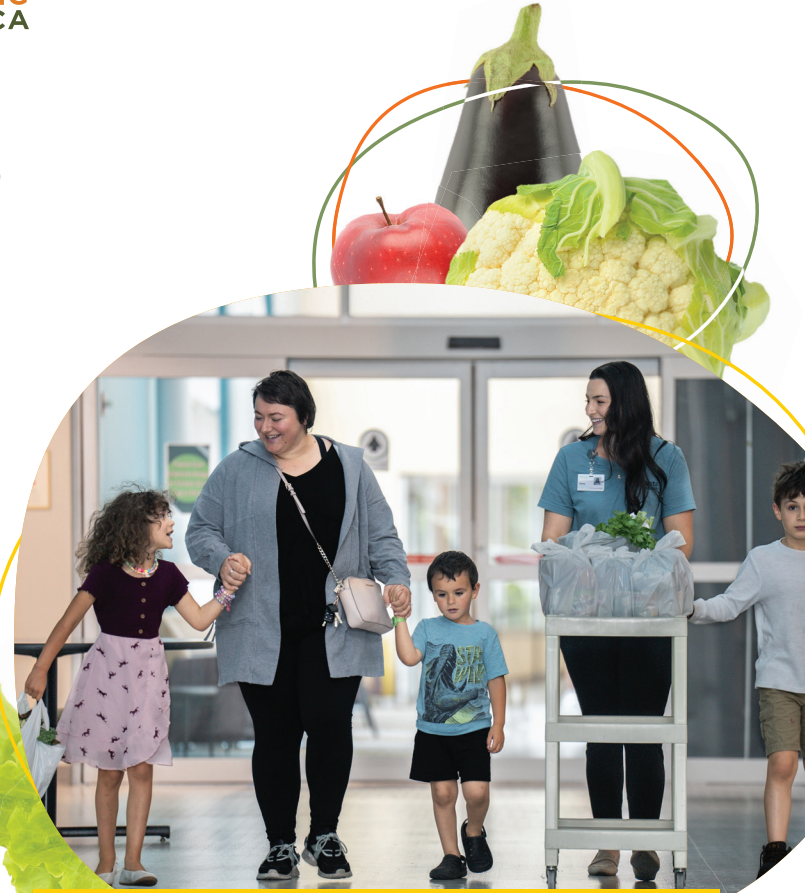
A patient at the Food Bank's Food Pharmacy partner, Augusta Health , receives nutritious food after her health care visit.

Food insecurity significantly impacts health outcomes, increasing the risk of chronic conditions, emergency department visits, hospitalizations, and mental health challenges. Lack of nutritious food leads to higher