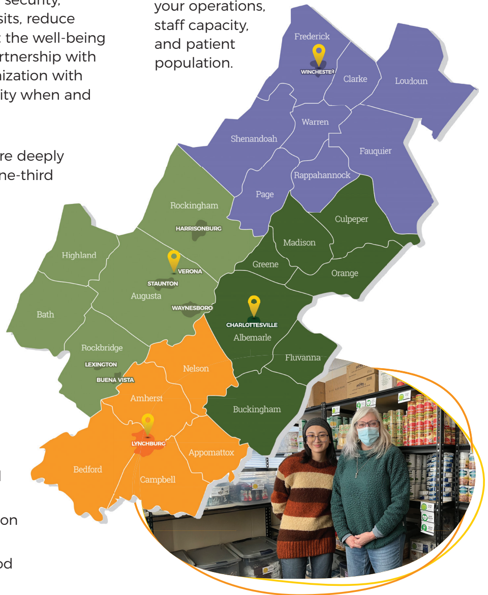
Staff at the Free Clinic of Culpeper , ready to help patients shop for free, medically tailored groceries.

■ Experience and infrastructure you can trust: The Food Bank has been serving the region since 1981. We collaborate with more than 400 community organizations. With partnerships at more than 30 healthcare sites—including hospitals, FQHCs, and free clinics—we know how to co-create flexible, sustainable programs that fit your operations, staff capacity, and patient population.